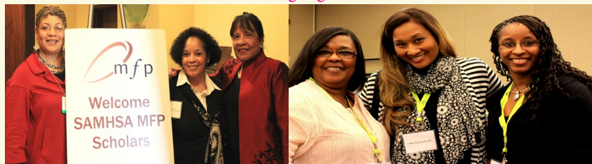
Photo Highlights: 2014 American Nurses Association and American Psychiatric Association Minority Fellowship Program Trans-Disciplinary Intensive Winter Institute. Click here to watch video highlights.